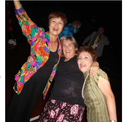
Our Page 3 Girls

31% of the Rotary Club of Glen Eira's active members are female. Globally, women represent about 12% of Rotary membership. We do not select new members based on gender but clearly our club is closer to representing society than the rest of Rotary.