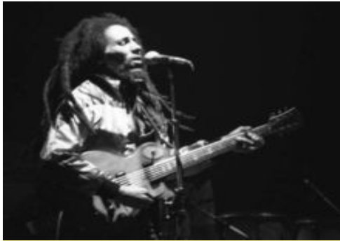
Bob Marley in concert, Zurich, 1980.