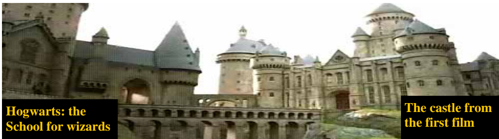
Hogwarts: the School for wizards